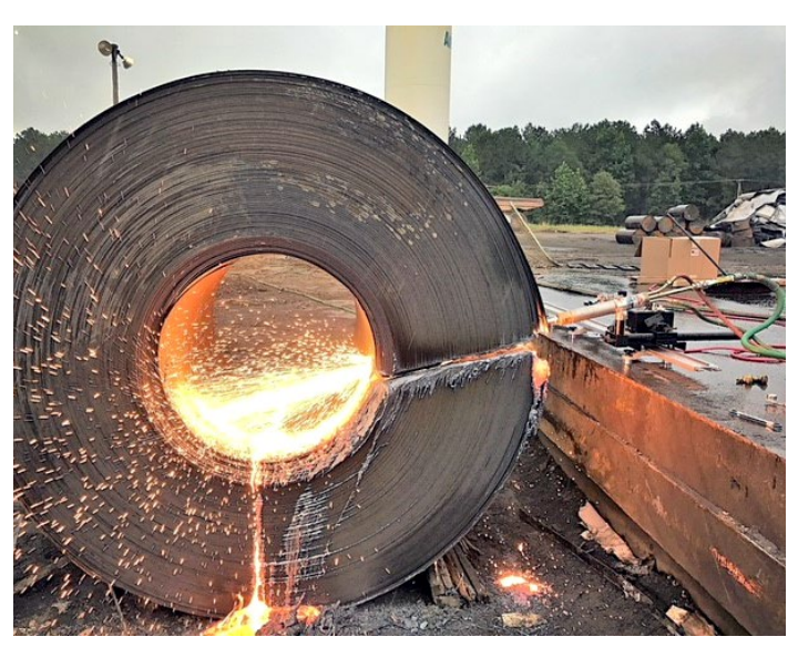
Coil Cutting Systems