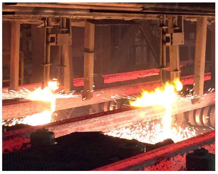
Caster Cut-Off Systems