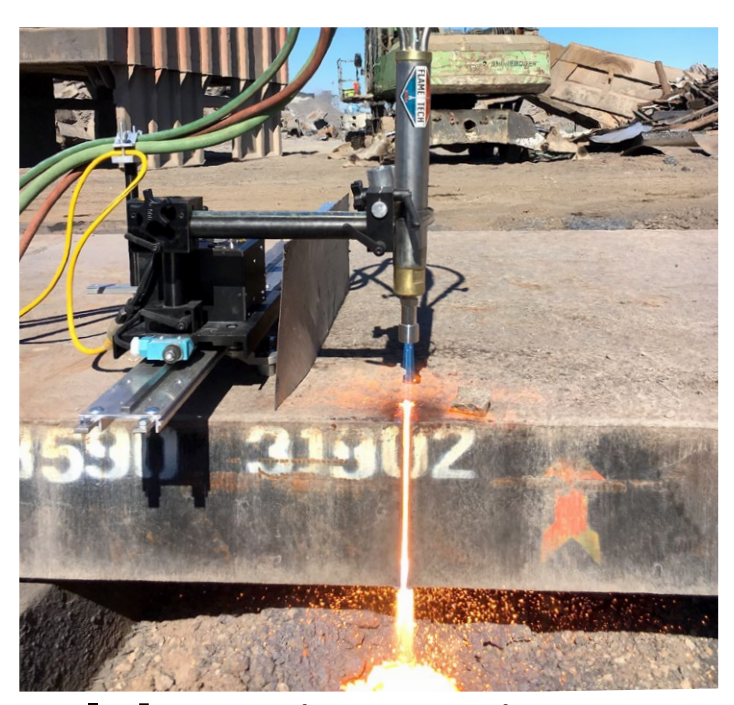
Slab Cutting Equipment