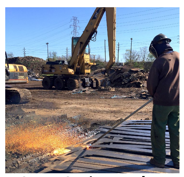
Scrap Cutting Torches